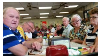
Lunch at Green's Pharmacy

Sometimes that means adjusting the way we do things. What is your opinion on rally dates, lengths at campgrounds and who we permit to attend our rallies? If we don't embrace new and younger members and their families and lifestyles, we may find it hard to grow.