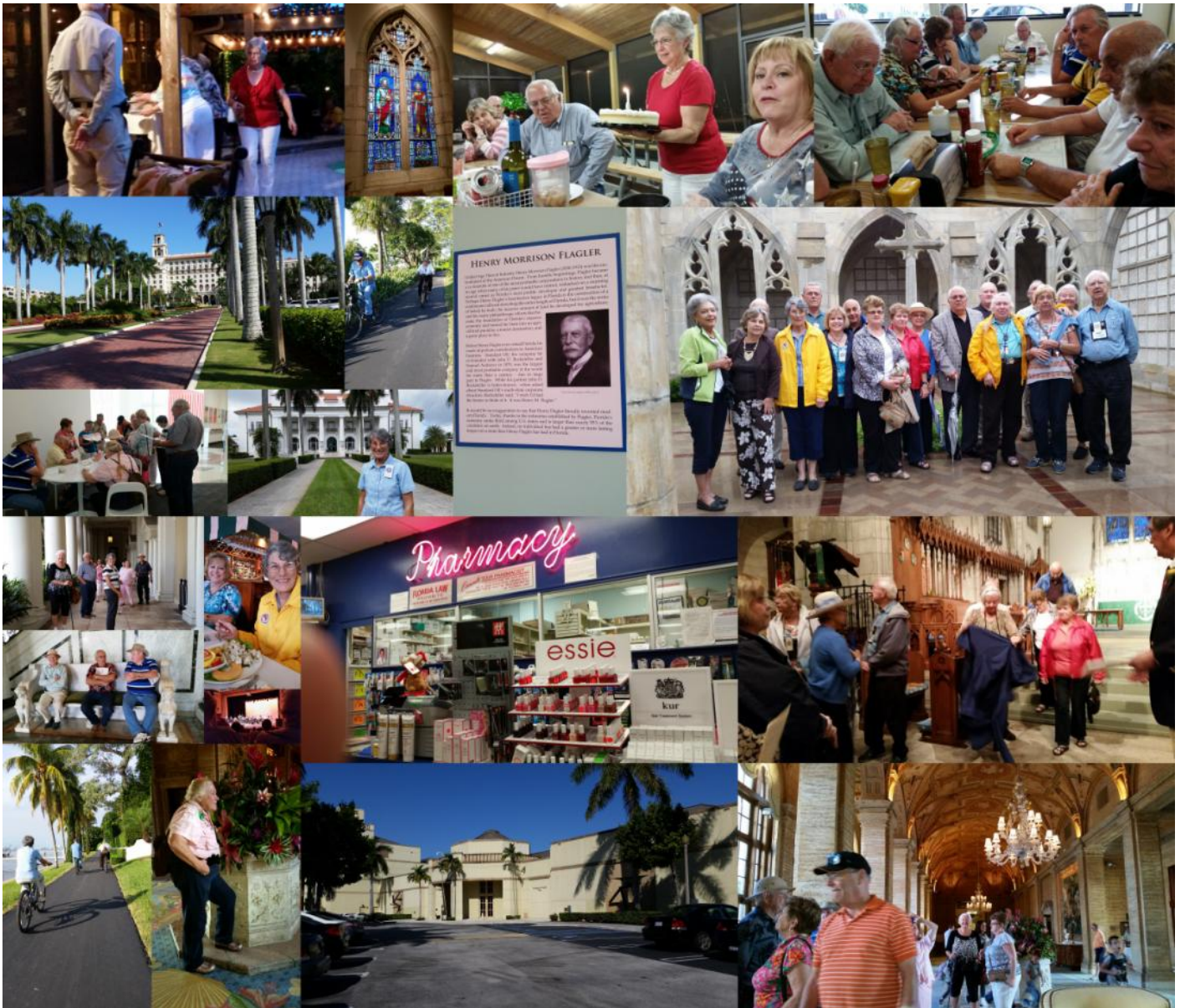
A week of Adventure in Palm Beach, Florida