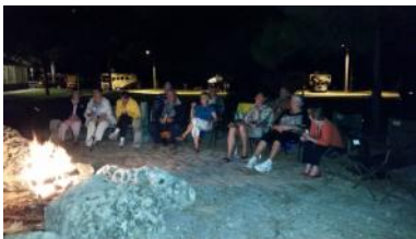
After dinner fireside chat

We as an Airstream RV club just want to enjoy our friends, our rallies and our caravans. I know in our South Florida Unit the friends I have come to know who attend our rallies are very dear to me and I look forward to seeing them at the next rally or caravan. We always have a great time! However there are many more members in our unit that have yet to come out and experience our fun and friendship. I encourage all our members to attend our rallies and/or caravans and become new best friends and enjoy the fun things we are experiencing.