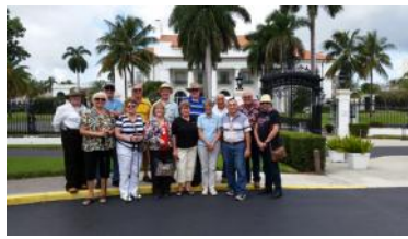
Tour of Flagler Whitehall