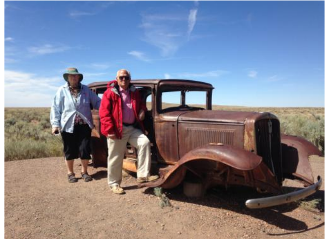
The Studebaker and the Airstreamers on old Route 66 in the Petrified Forest