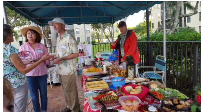
Last Years Party