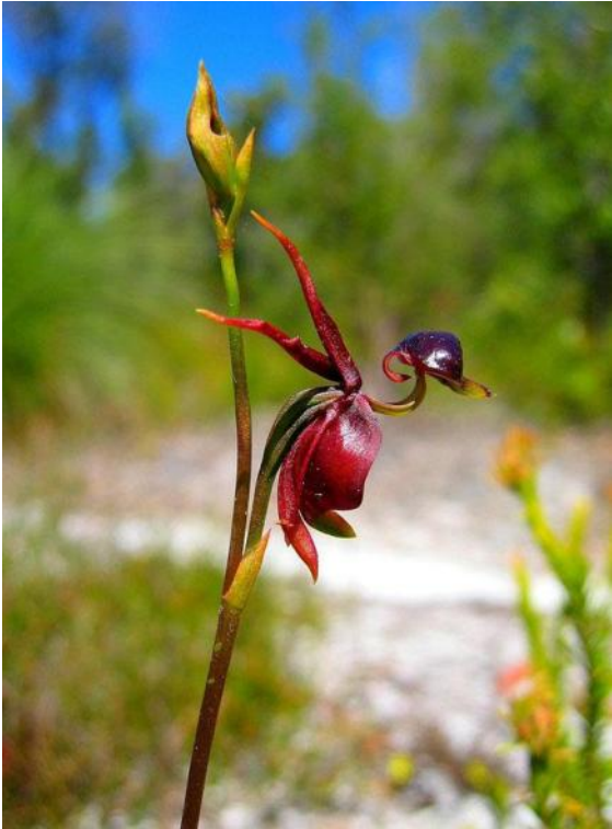
Flying Duck Orchid (Caleana Major)