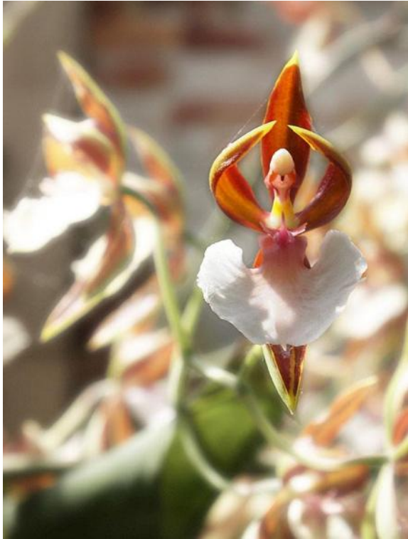
An Orchid That Looks Like A Ballerina